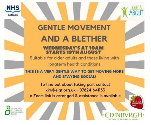
Figure 4. An online exercise group from Edinburgh & Lothians Greenspace Trust.

Several online programmes have incorporated physical materials that were distributed to clients. A good example is Edinburgh Community Food's Discover Programme, which saw the delivery of recipe packs to families across Edinburgh in conjunction with a cooking programme delivered online. Health All Round participated in the Gorgie Dalry Home Grown Project which saw fifty grow-your-own kits delivered to local people, supported by online tutorials and interactive chats. Libertus Services also distributed packs to allow their clients to take part in exercise.