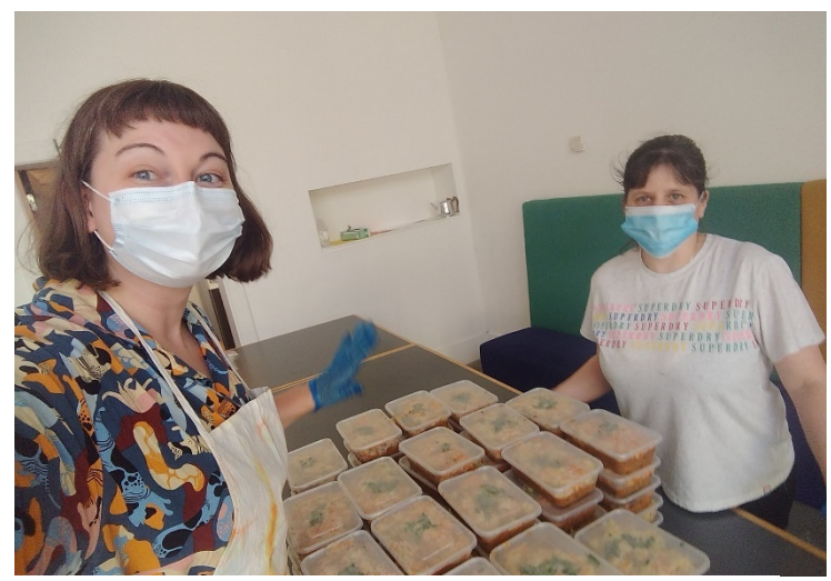
Figure 1. Workers at WHALE Arts packing meals for distribution in the community.

Organisations not directly involved in the distribution of food also helped with these efforts by referring their own clients to appropriate local services. Examples include One Parent Families Scotland and The Junction.