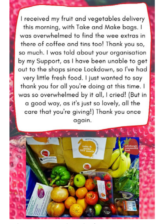
Figure 13. A testimonial from someone supported by Edinburgh Community Food.

Clients also felt supported by the human connections they were able to maintain with staff and other community members. Organisations were proactive in communicating with clients to help them better understand the situation; were responsive to clients' needs and queries; informed them of support available from their own and other services; as well as simply being someone to talk to in a difficult time.