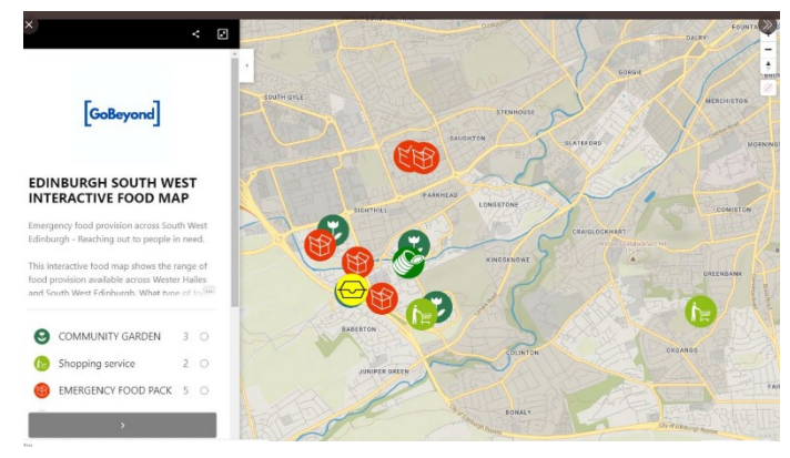
Figure 18. GoBeyond interactive food map