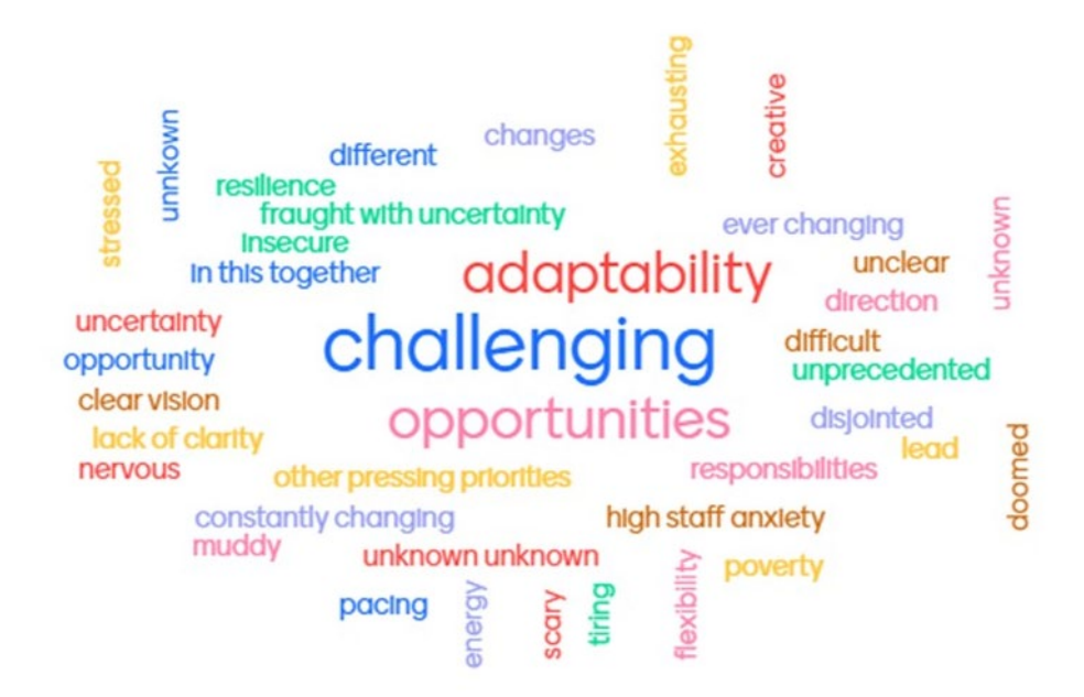
Figure 20. Forum members' reflections on planning and delivering services during the pandemic.

Forum members have been very positive about their experiences working with new and existing partners, to deliver essential services. Members reflected that one organisation alone would not have had the capacity to address the need for food or mental health support in local areas across Edinburgh. Therefore, members are very positive about what they have been able to achieve as a collective.