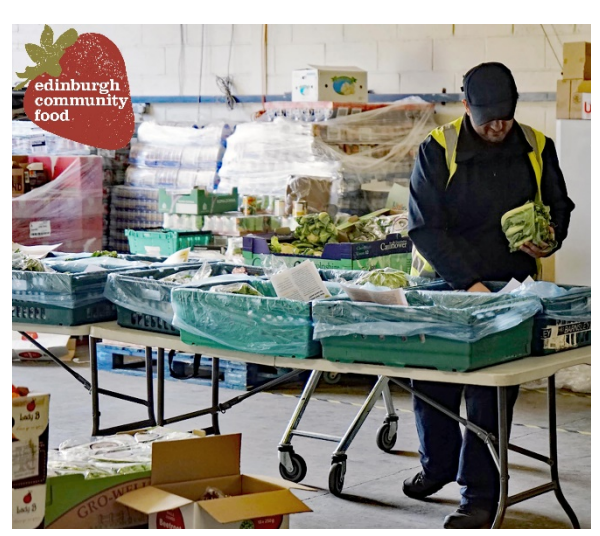
Figure 2. Food boxes being packed and prepared for distribution at Edinburgh Community Food.