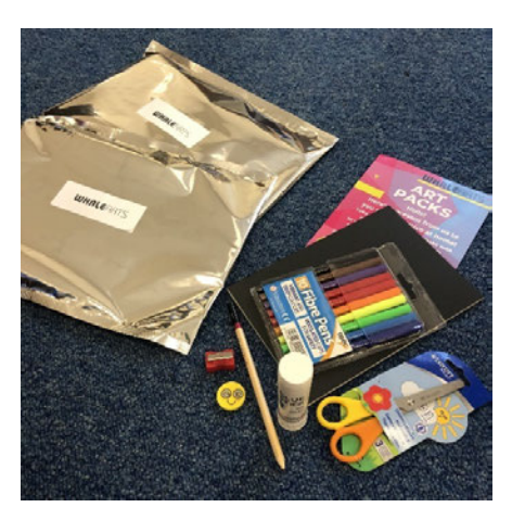
Figure 11. Art packs distributed by WHALE Arts.