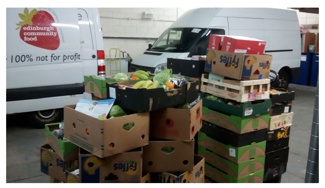
Figure 19. Food boxes being packed and prepared for distribution at Edinburgh Community Food.

Alongside the additional resources, Forum members reported being able to move at a fast pace to ensure both staff and volunteers were enabled to work from home. Organisations had to quickly adapt to online working, becoming proficient in using various tools such as video conferencing and online communication platforms. Members created guides for various online tools and adapted their workflows to fit around online platforms and, in some cases, they shared this learning more widely.