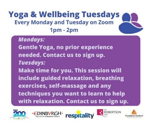
Figure 7. A regular online yoga class from Care for Carers