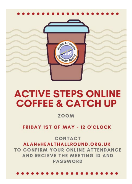
Figure 8. A group run by Health All Round.