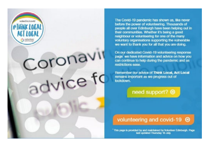
Figure 12. A hub page for COVID-19 volunteering advice on the Volunteer Edinburgh website.