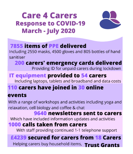
Figure 15. Care for Carers services provided from March to July 2020.

Staff and volunteer reflections also suggest these efforts were vital in helping to mitigate the worst effects of the COVID-19 outbreak on those most at risk. There was a widespread sense that community health organisations were best placed to respond locally to the pandemic because they were deeply embedded in and trusted by their communities, and had the knowledge, connections and experience necessary to act quickly and flexibly even in the face of unprecedented circumstances. Ongoing efforts to sustain these services, and support them to adapt their work to the changing needs of their communities, will no doubt continue to be necessary even as lockdown eases.