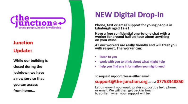
Figure 5. A digital drop-in for young people from The Junction.